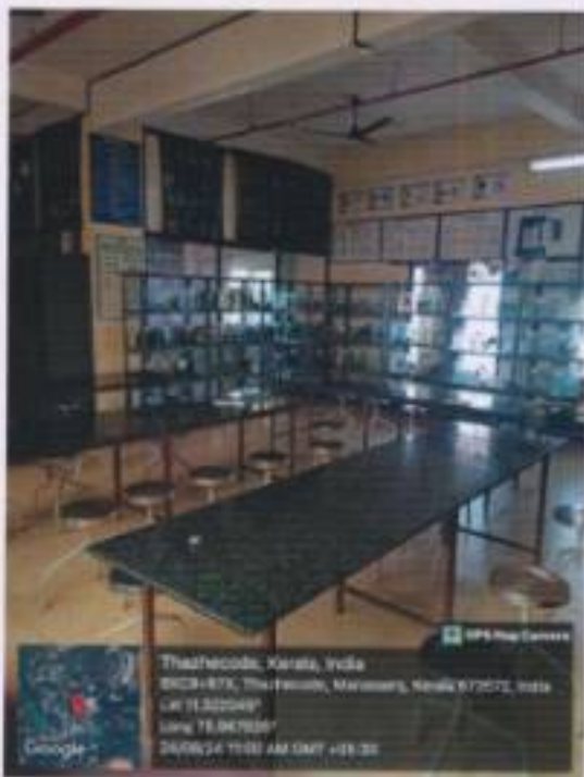
DEPARTMENT OF DRAVYAGUNA VINANA ROGANIDANAM LAB

Approved by NCISM and Affiliated to Kerala University of Health Sciences.